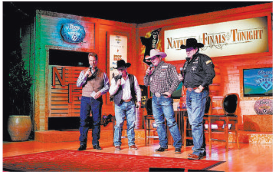
National Finals Show at the Gold Coast