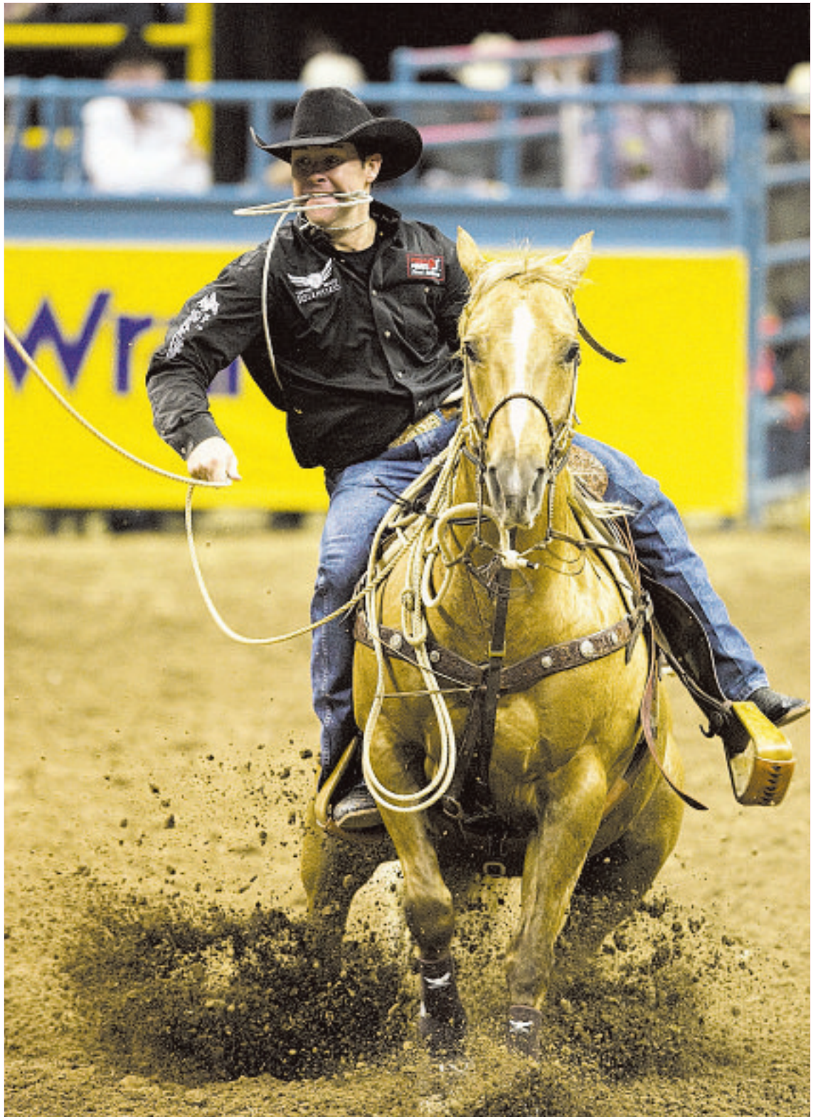
Ten-time world all-around champion cowboy Trevor Brazile has 54 go-round wins in National Finals Rodeo competition, a PRCA record. Brazile has won seven consecutive all-around titles heading into the 2013 NFR.

"After the 10th round, when you walk out there and they hand you a gold buckle, and you're standing there all by yourself," he said. "I enjoy that."